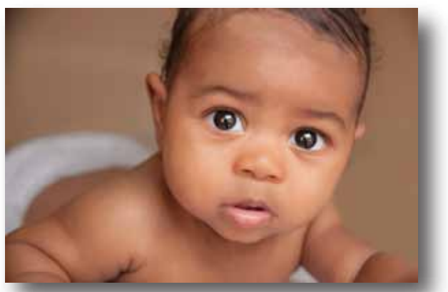
What if I was never born?

In addition to abortion, infanticide has a long history in the United States. While infanticide is currently considered a much bigger taboo than